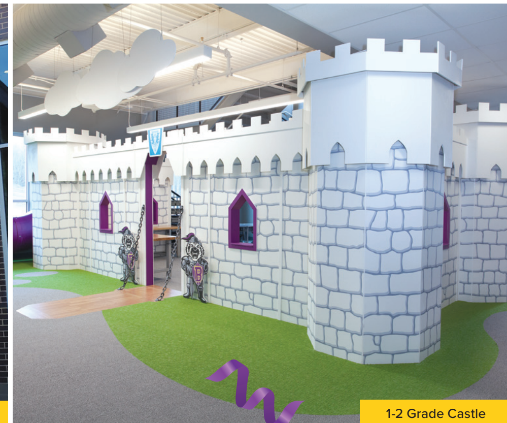
1-2 Grade Castle

Well, we're at the finish line with the construction of our new $51 million school project. I'd like to personally invite you to join us for our ribbon-cutting ceremony on August 9, 2022 at 6 p.m. in the North parking lot of our new school in front of the high school and middle school entrance.