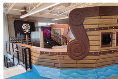
Middle School Pirate Ship