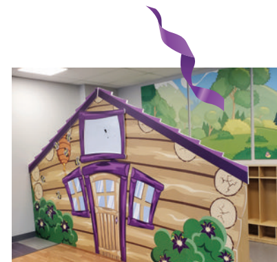
Kindergarten Log Cabin