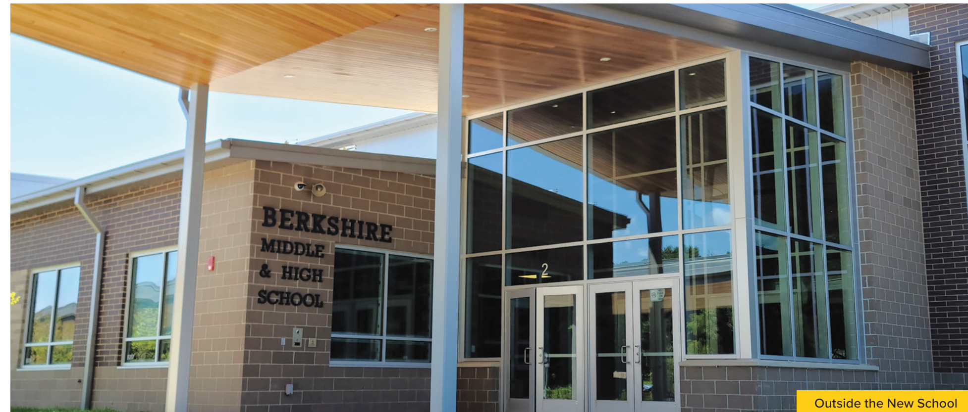
Outside the New School