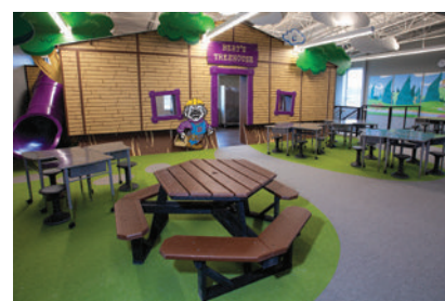
3-4 Grade Treehouse

allows our students to earn a living wage, have access to quality health care benefits, and the opportunity for advancement in their chosen field. Our goal is to offer many different paths for our students to achieve the American Dream, as we recognize that there is no "one-way" for them to pursue this.