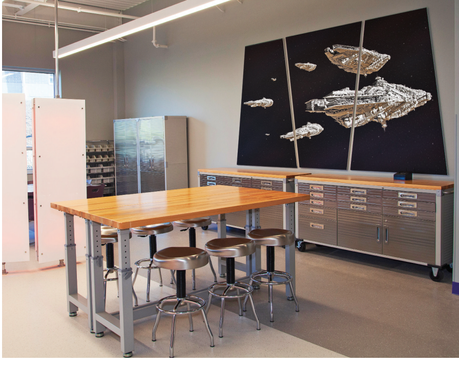
High school students learn in an Innovation Lab.

On reflection, I wish I had hired an owner representative. Our finance team and school board members helped tremendously throughout the process, but we're not construction experts. I believe the process would have benefited from an owner representative. Other advice I can offer based on my lessons learned include: