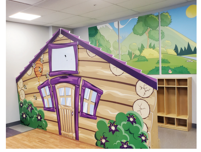
A log cabin welcomes kindergartners to their learning area.

Although many bond referenda fail on the first try, voters passed ours by almost a two-to-one margin; however, success came because we were very deliberate about raising support.