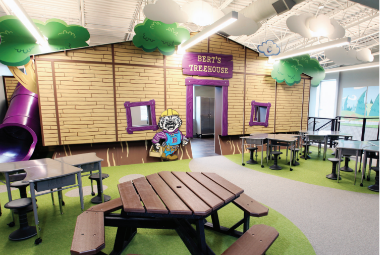
Third and fourth graders enjoy a treehouse theme.